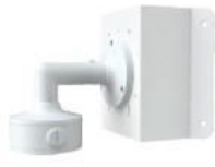
NAV-DJB + TNAV-BPB + NAV-SAC