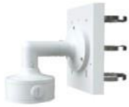
NAV-DJB + NAV-BPB + NAV-SAS