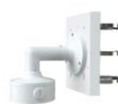
NAV-DJB + NAV-BPB + NAV-SAS