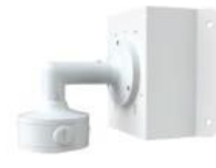
NAV-DJB + NAV-BPB + NAV-SAC