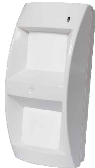
SETTABLE by PC