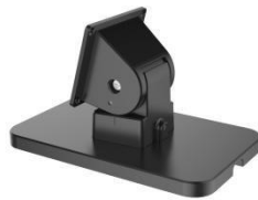
NAV-NGT Desktop Mount