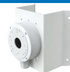
NAV-DJD + NAV-SAC