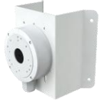
NAV-DJD + NAV-SAC