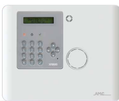
XR800 XR900 wireless control panel

It is usable with all 800/900 Series wireless system